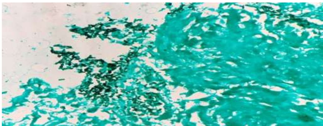
Figure 3: GMS staining of the candidal hyphal filaments and yeasts (GMS, \times 400 ).

Additional work-up including hepatitis profile, T-lymphocytes counts, HIV test, VDRL-syphilis, anti-nuclear antibodies were normal while assessment of T-lymphocytes function by Mitogen stimulation test was abnormal suggested altered immune status.